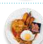
BOLON CON BISTEC ENCEBOLLADO $15 GREEN PLANTAIN BOLON SERVED WITH STEAK AND PEPPERS STEW, SWEET PLANTAIN & FRIED EGG