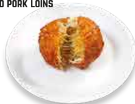
BOLON DE QUESO & MADURO $9 MASH GREEN PLANTAIN AND SWEET PLANTAIN WITH CHEESE