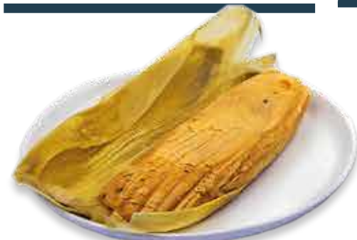
HUMITA FRITA $6 FRESH CORN WRAP PAN FRIED