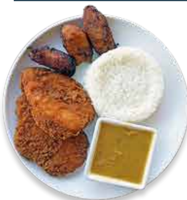
BANDEJA PECHUGA EMPANIZADA $16 BREADED CHICKEN BREAST SERVED WITH RICE, BEANS, PLANTAINS AND SALAD WITH AVOCADO