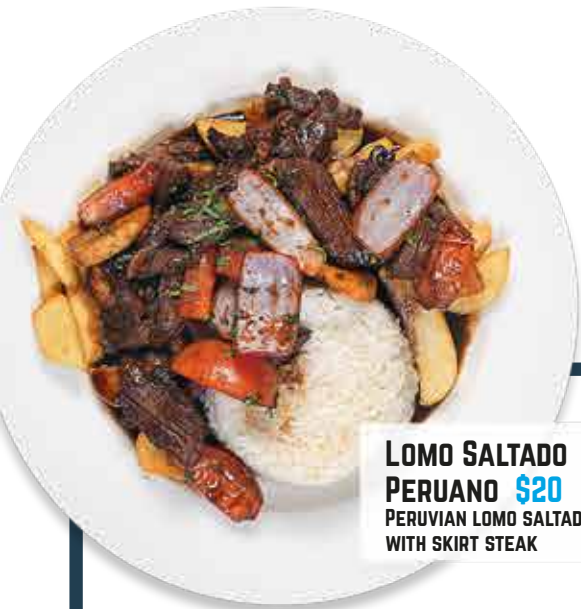
LOMO SALTADO PERUANO $20 PERUVIAN LOMO SALTADO WITH SKIRT STEAK