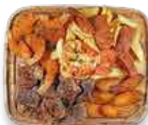
PICADA DE CARNE & MARISCOS $36 MIXED PICADA, LOBSTER TAIL, SHRIMP, GRILL SLICED RIBS, FRIES, SWEET PLANTAIN