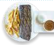
ENTRAÑA ASADA $27 GRILLED SKIRT STEAK SERVED WITH RICE, BEANS AND FRIES.