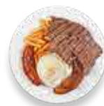
BISTEC A LO POBRE $17 CHILENIAN STEAK PLATTER SERVED WITH RICE, FRIES, CHORIZO & FRIED EGG