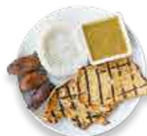
BANDEJA PECHUGA ASADA $16 GRILLED CHICKEN BREAST SERVED WITH RICE, BEANS, PLANTAINS, SALAD & AVOCADO