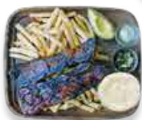
2 COSTILLAS DE RES CON PAPA Y ARROZ $18 2 GRILLED SLICED RIB SERVED WITH RICE, FRIES AND AVOCADO