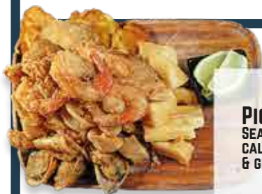
PICADA MARISCOS $25 SEAFOOD PICADA, FISH FILLET, CALAMARI, MUSSELS, SHRIMP, CASSAVA & GREEN PLANTAINS