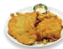
PECHUGA EMPANIZADA CON PAPA FRITA $14 BREADED CHICKEN BREAST SERVED WITH FRIES