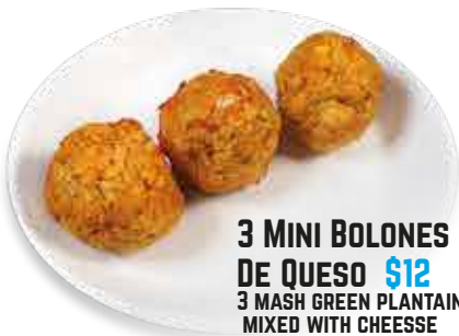
3 MINI BOLONES DE QUESO $12 3 MASH GREEN PLANTAINS MIXED WITH CHEESE