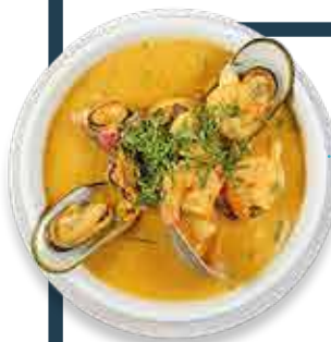
SOPA DE MARISCOS $19 SEAFOOD SOUP