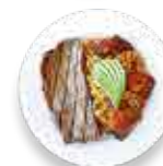
CALENTADO CON CARNE ASADA & MADURO $16 RICE SAUTEED WITH SOFRITO SERVED WITH STEAK, PLANTAINS & AVOCADO