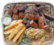
PICADA CHURRASQUERIA $36 STEAK PICADA SERVED WITH SKIRT STEAK, GRILLED RIBS, CHORIZO, GRILL CHICKEN BREAST, FRIES & SWEET PLANTAIN