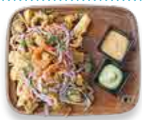
JALEA $23 PERUVIAN SEAFOOD JALEA PICADA